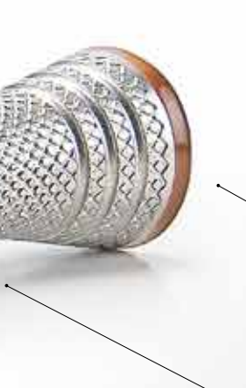
Universal Hub accommodates all attachments

Alignment dots and Snap-Connect guide assembly/disassembly of attachments to motor in an easy and consistent manner